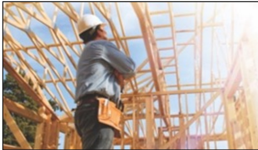
New Business Construction